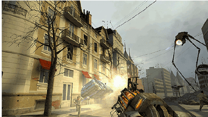
Figure 2. A screen shot from Half Life 2, for which the Source Engine was developed.

constraints involved, it was established at an early stage that the development of a complete game engine would not be feasible. Thus an existing game engine was used to create the game. After investigating a number of options, Valve's Software Source Engine ( www.valvesoftware.com ) developed to create Valve's Half Life 2 ( www.half-life2.com ) was selected. The Source Engine has a number of compelling features which include highly realistic physics modelling, the capacity for sophisticated scripting and the existence of an active and helpful community of professional and amateur developers. The challenge in using the Source Engine was that it was designed for developing a game so different to Serious Gordon that it was unclear if it could be successfully turned to this new purpose. A screenshot of Half Life 2 is shown in Figure 2 to illustrate this point.